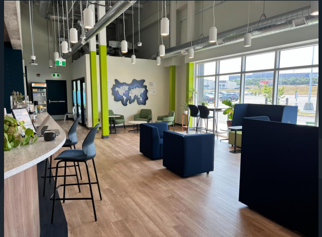
View of café (1 st floor)