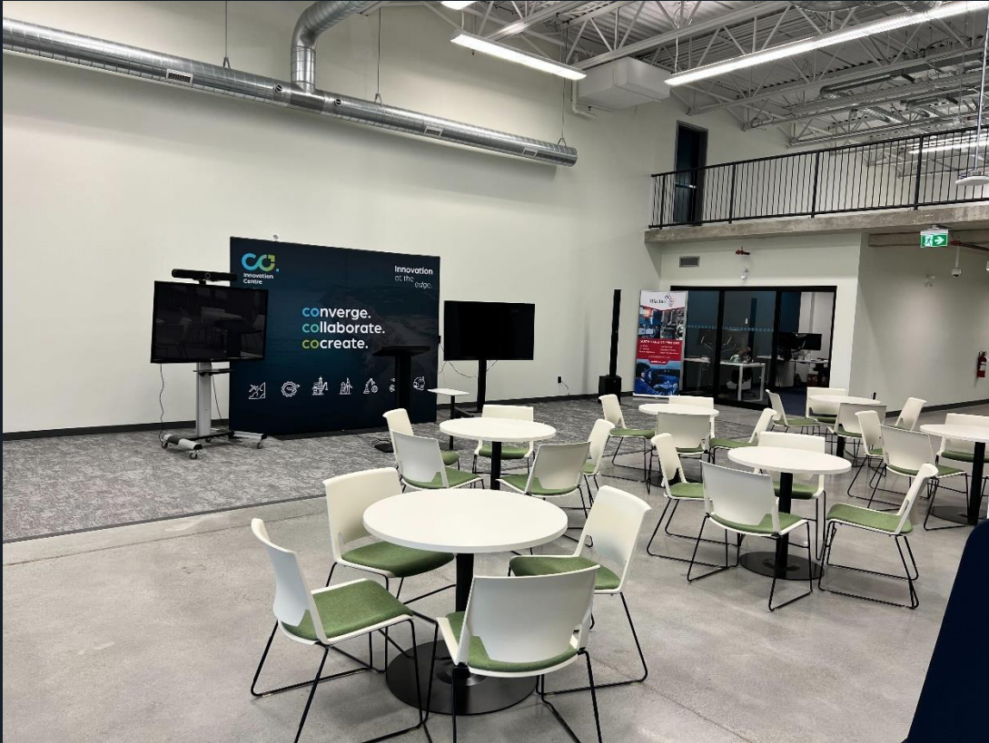
Presentation Space (1 st Floor)