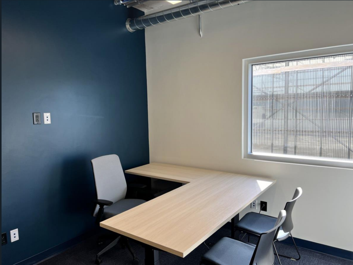
View of private office (1 st floor)