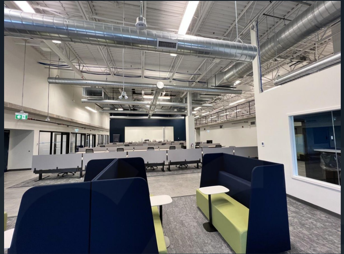
View from front of building (1 st floor) - open desks and collaboration space