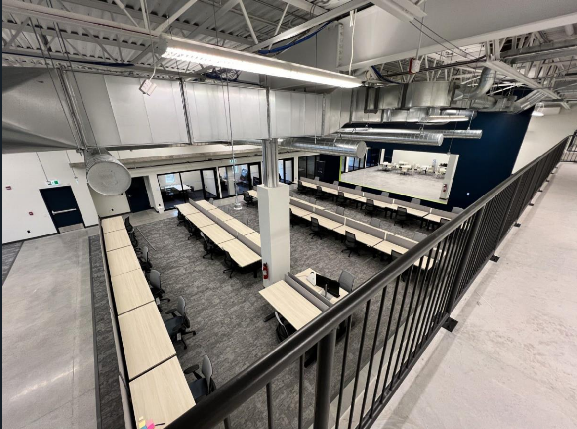
View from mezzanine - open desks and collaboration space